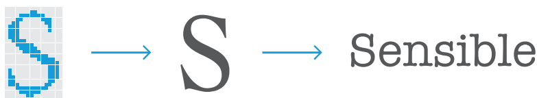
Figure 1: Pixels become letters become text

The OCR process examines the text image and creates computer-editable text from scanning the tiny dots (pixels) that together form a picture of text. So as the OCR engine scans the pixels it builds up what it believes to be a letter, see Figure 1: Pixels become letters become text. This is then matched through a series of pattern and alphabet matching to a corresponding letter.