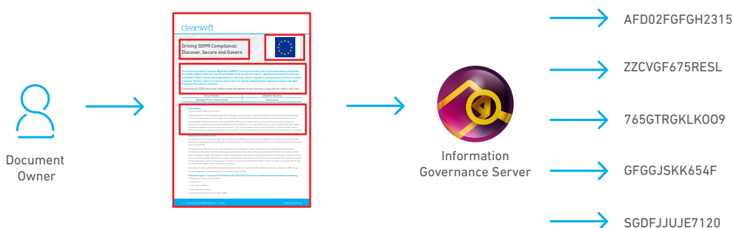
Diagram 2: User registers file with Clearswift IGS. The file and information within the file is fingerprinted for tracking and monitoring when shared.

The Clearswift Information Governance Server (IGS) sits in the heart of the network and provides a central repository for critical information. This information is not just complete files, but also partial file information. Files are registered by the end user, Document Owners, and then the information is fingerprinted to enable monitoring as it flows through email or across the organisation boundary. The IGS database contains both the full fingerprint values as well as the partial information fingerprints. The fingerprints created use a one-way hashing algorithm to ensure that no critical information can be reverse engineered into its original values.